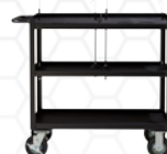
OMSCP Cart with pneumatic wheels