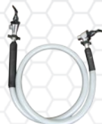
WC-1019 Jug filler