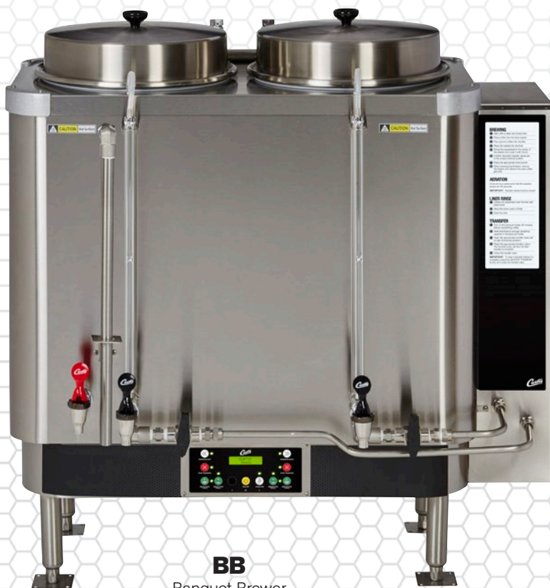
BB Banquet Brewer