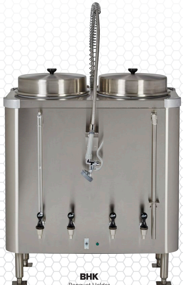
BHK Banquet Holder

Digitally Controlled Coffee Temperature Brews Up To 9.0 Gallons on Each Side Auto/Manual Coffee Agitation Dual Wall Insulation Automatic Refill Closed Brewing System Half/Full Batch Programmable Custom Volumes Coffee Fresh Indicator Hot Water Faucet