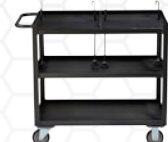
OMSCR Cart with rubber wheels