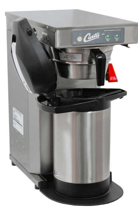
TLP Shown with 1.9L TLXP1901S000 (Pourpot Sold Separately)