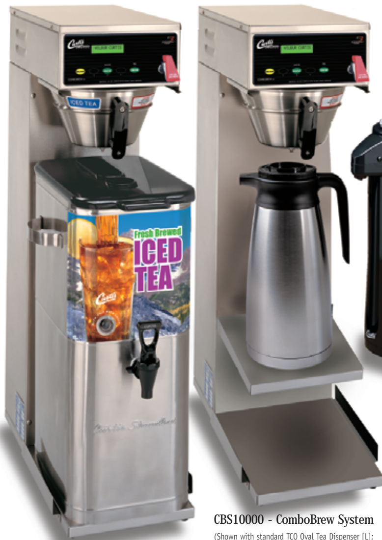
CBS10000 - ComboBrew System

Revolutionary Design TWO Ultra-Precision Inlet Valves and Water Level Sensor System provide unsurpassed tea flavor.