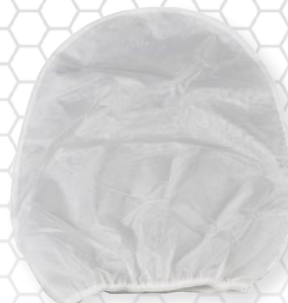
WC-9910 Toddy strainer

1 Toddy reusable coffee strainer 50 Toddy one-time use paper filters with string