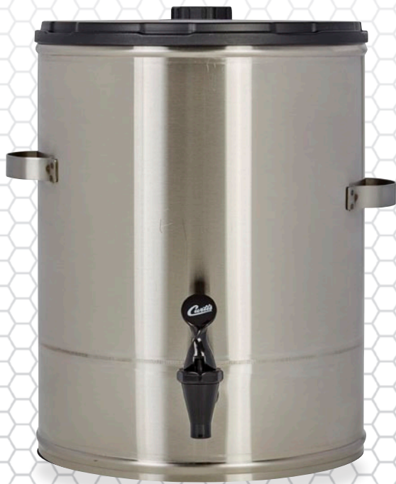
TC-6HK 6.0 Gallon Cold Brew Coffee System