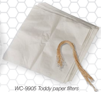
WC-9905 Toddy paper filters