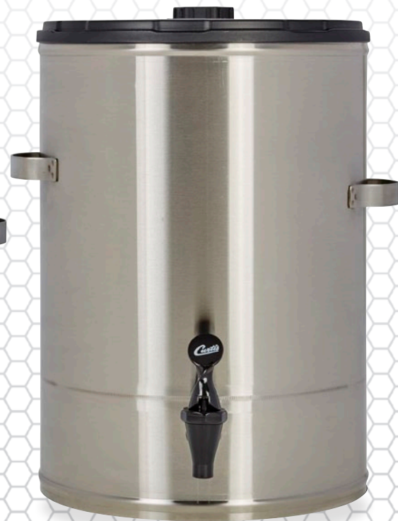
TC-7HK 7.0 Gallon Cold Brew Coffee System